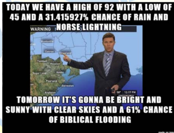
Houston Weather in April